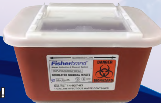
Free "Sharps" Container

Appropriate containers include coffee cans and bleach bottles. When the container is 3/4 full, tape the lid on it with duct tape and clearly mark the container with the word "SHARPS".